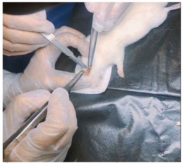
Figure 1. Optic nerve transection protocol in rats

The behavioral apparatus was a black wooden Tmaze. A start box (10 cm in length) opened to the