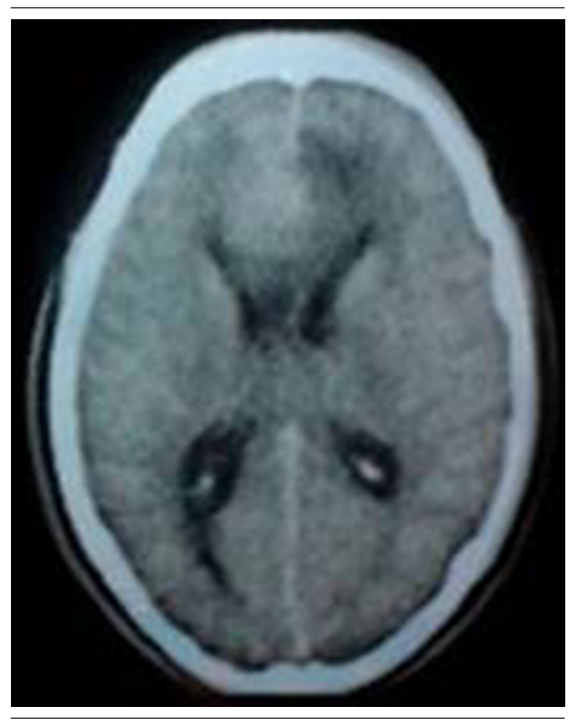
Figure 1. Noncontrast-Enhanced Cerebral Computed Tomography Showed a Giant Expansive Tumor in the Frontal Lobe With Middle Compression on the Right Ventricular Horn

The patient was discharged from the psychiatric ward with necessary recommendations and was admitted to the neurosurgery ward for further evaluation.